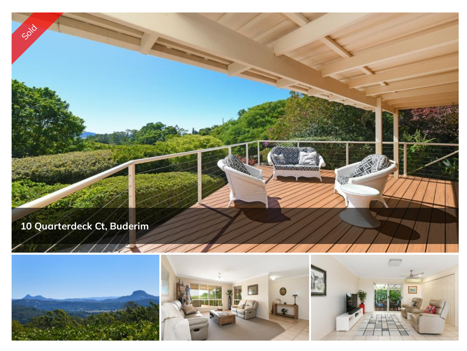
The ultimate in position, privacy and peaceful living on top of Buderim's North East Escarpment

UNDER CONTRACT - SOLD PRIOR TO AUCTION. All open homes have been cancelled.